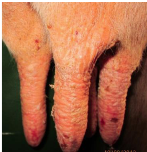
Figure 5: Group II: Teat showing complete wound healing on 10 th day postoperatively.

without any appreciable complications. It also aided in restoration of the healthy status of the teat and the functional capacity of the teat in all the cows in the treatment group.