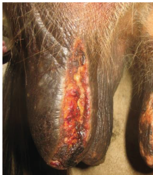
Figure 1: external teat wound.

A total number of 36 cross bred jersey cows with external teat injury without involving the teat cistern (Figure 1) and with exposed of teat sinus (Figure 2) were subjected for the present study. All the cows were cross bred Jersey. Clinical examination of the teat for its, teat shape, length, distance from the ground and etiology of the teat wounds were recorded. Following preoperative evaluation, the animals were divided into control group with 12 animals treated with Povidone iodine and treatment group with 24 animals each. In control (Group I) the external wound was sutured as per the standard procedure and protected with gauze with Povidone iodine solution. In treatment (Group II), after suturing the wound was protected with sheets of collagen and calcium alginate as protectants.