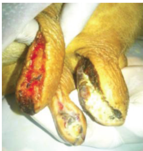
Figure 2: Exposed teat cistern.

Animal particulars, Morphometric details like shape of the udder and teats were recorded.