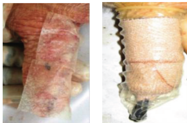
Figure 4: Suture site applied with Protectant and Bandaged.