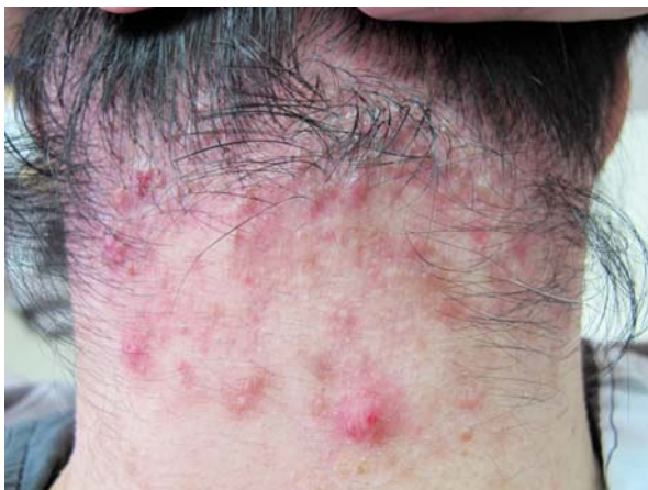
Figure 3: The inflamed and granulomatous lesions had subsided remarkably.

After two weeks, the inflamed and granulomatous lesions had subsided remarkably (Figure 3). The therapy lasted for 6 months and his skin lesions almost healed up.