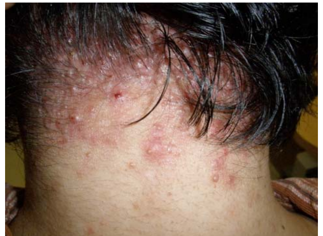
Figure 1: Red deep-seated follicular aggregated nodules, granulomatous nodules, erosion, hypertrophic scar, keloids, and tufted hairs with clear exudate discharge and hemorrhage on the occipital area.

biopsy was performed. H&E staining showed obstruction of follicle with remarkable hyperkeratosis in the follicular infundibulum, and perifollicular cell infiltration in the upper dermis (Figure 2a). Higher magnification showed hyperkeratosis with keratohyaline granules and dense neutrophils, lymphocytes and plasma cells and fibrosis around the follicle in the dermis (Figure 2b). Bacterial culture from the lesions found Staphylococcus epidermidis . Laboratory findings showed elevated WBC (13660/ \mu l), ALT (77 U/dl), ZTT (31.8 IU/dl), CRP(0.81 mg/dl), and IgM(226 mg/dl). Serum cortisol, testosterone, and free testosterone were within normal limits.